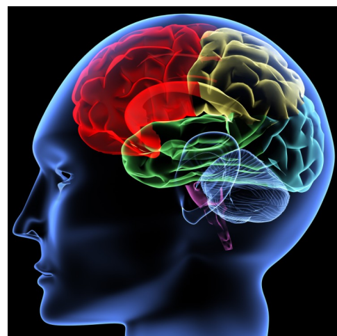
Fibromyalgia, Chronic Fatigue & Anxiety Disorders