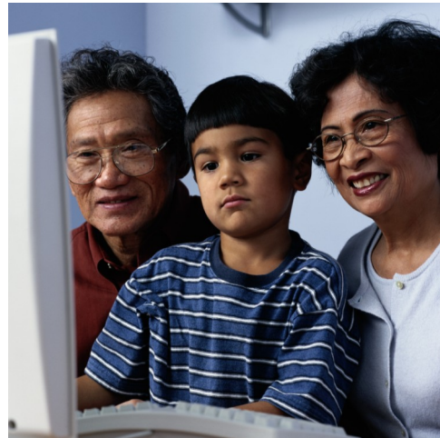
Attention and Learning Disorders