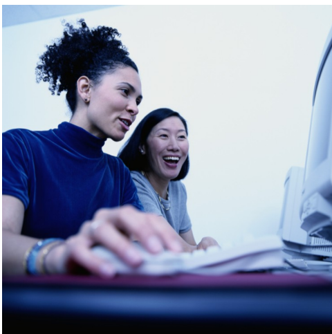
Depression and Mood Disorders