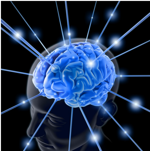
Biofeedback for the Brain